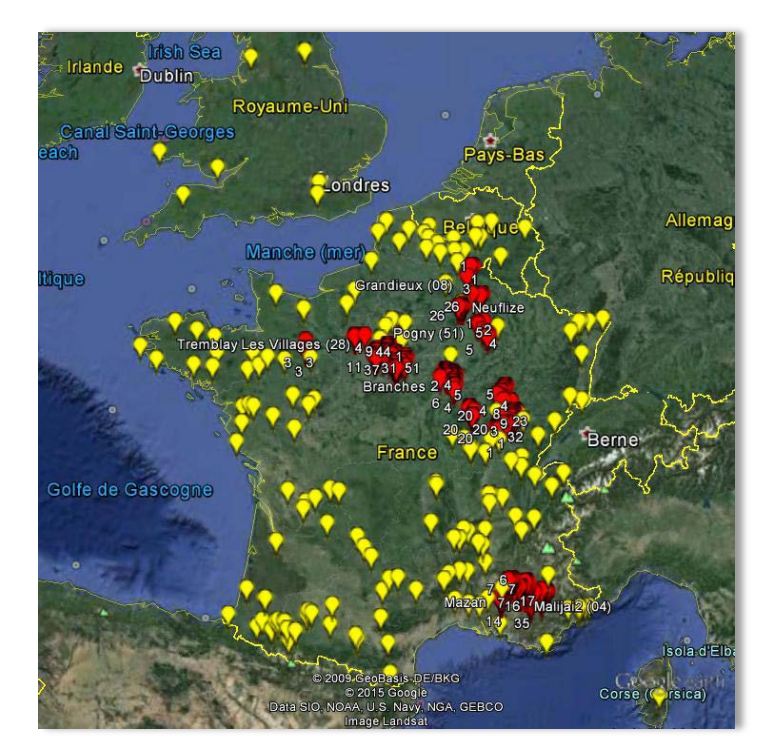
Fig. 1 locations where Detection Efficiency could be measured (in red) or Location Accuracy could be evaluated (in yellow)

Using newspaper reports, insurance claims or maintenance logs, it is possible to compare the position of known damages with the nearest lightning. The accurate localization of the damage may be difficult obtain; and the cause of the failure must be clearly identified before any correlation is attempted, thus the analysis is mostly manual and time consuming. But this method provides a simple mean to gather evidences from many different places and thus evaluate the performance of a network over all the covered area. A study performed with 101 reports scattered throughout our network between 2011 and 2014 shows that in all cases a lightning flash had been detected close to the damage; the distance between the nearest flash and the reported place was found to be lower than 200 meters in most cases. Taking in account the fact that not only direct strokes produce damages but also close by flashes induce deleterious effects, those values confirm our estimated accuracy.